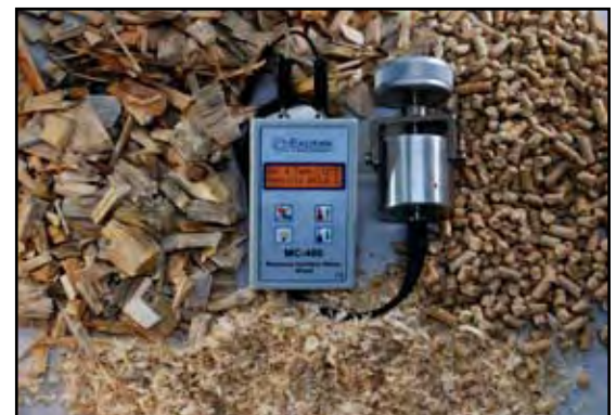
MC-460 with Compression Cup for Wood Chips, Pellet and Sawdust