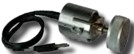
S-40 Compression cup for Wood Chips, BioFuels Pellets and Sawdust