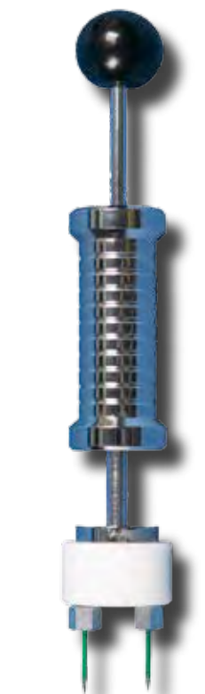
S-30 Sliding Hammer Probe for Sawn Timber and Wood